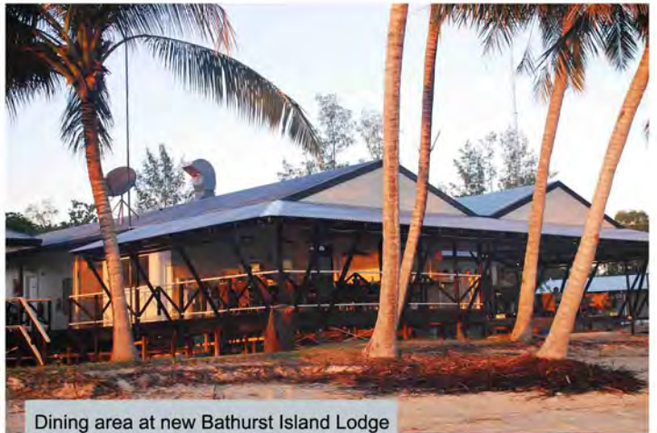
Dining area at new Bathurst Island Lodge