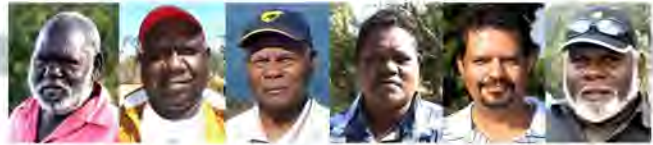
Managers Tiwi Land Council

As expected, your Tiwi Land Council Chairman, Managers, Trustees and Delegates have started 2013 full of running. Highlights for the first three months of the year include: