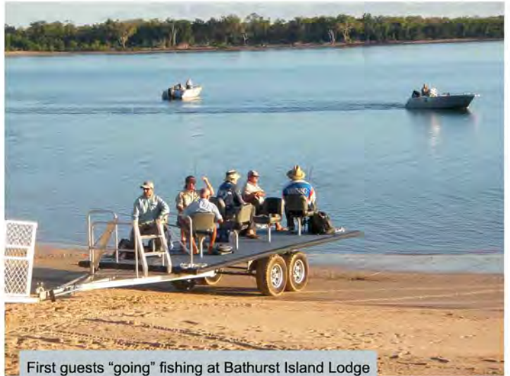
First guests “going” fishing at Bathurst Island Lodge

“Tiwi Islands Adventures is the largest guided fishing business in Australia and, with Bathurst Island Lodge now operating, could even be the largest in the world”. How good is that!