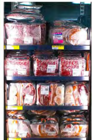
Fresh meat and sausages