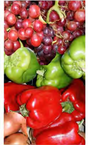
Grapes, capsicum, onions