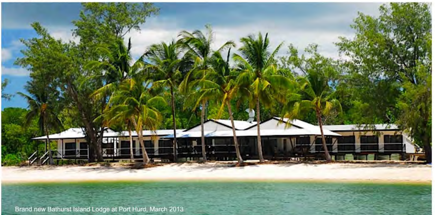
Brand new Bathurst Island Lodge at Port Hurd, March 2013